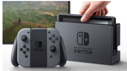
The upcoming Nintendo Switch.

After months of relative silence, Nintendo has finally revealed the actual name of its upcoming platform, which had been going by the codename of NX since its initial announcement in early 2015.