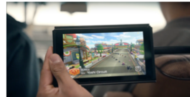
or without them.

It seems really easy to switch the console into its portable mode. You slide out two components of the controller and attach them to either side of the screen. Each part of the controller has a bank of four buttons and an analog stick. It appears that each section also has its own shoulder button. After that, you're ready to start gaming anywhere you want.