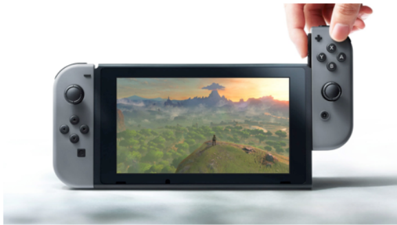
Can be played on the go with attachments...

When you're playing at home on your TV, it works like a normal system. You have a unit that will sit on a shelf or the floor, wires to be hooked up to your television, and a controller to play with that is connected to the console.